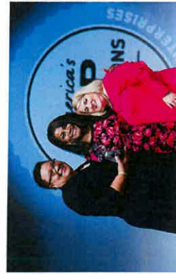
Awarded America's Top Corporation for Women's Business Enterprises – Platinum Distinction by the Women's Business Enterprise National Council (WBENC)