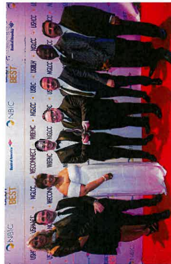
Awarded Best-of-the-Best recognition from the National Business Inclusion Consortium (NBIC)