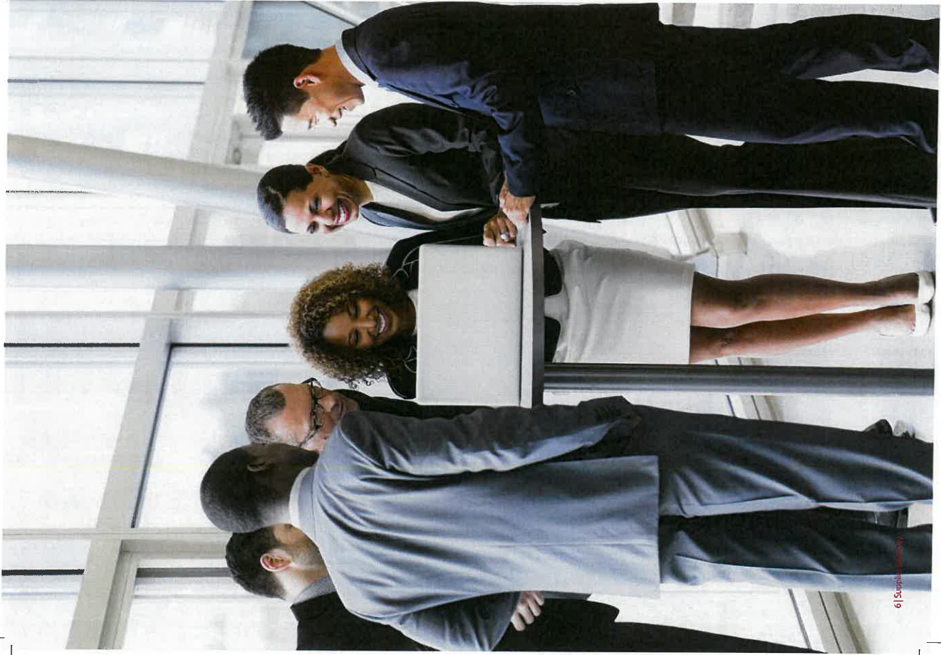
6 | Supplier Diversity