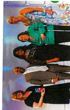
Receiving the Marketplace Innovator of the Year, Disability Inclusive Advertisment award from Disability:IN